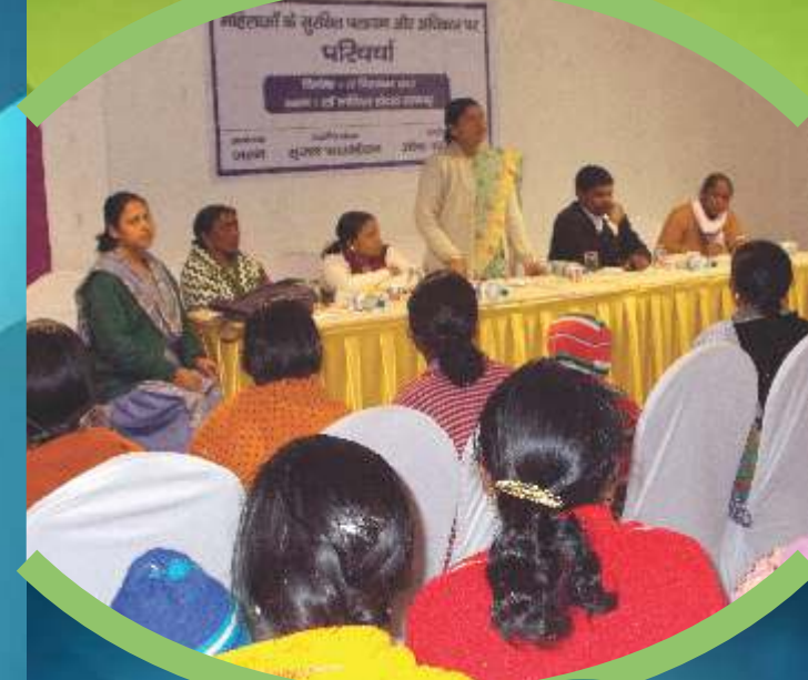
CAPACITY BUILDING TRAINING OF JATN

A Centre for information, Collation, Alliance Building and Evidence Based Advocacy for Promoting Safe Mobility in Jharkhand