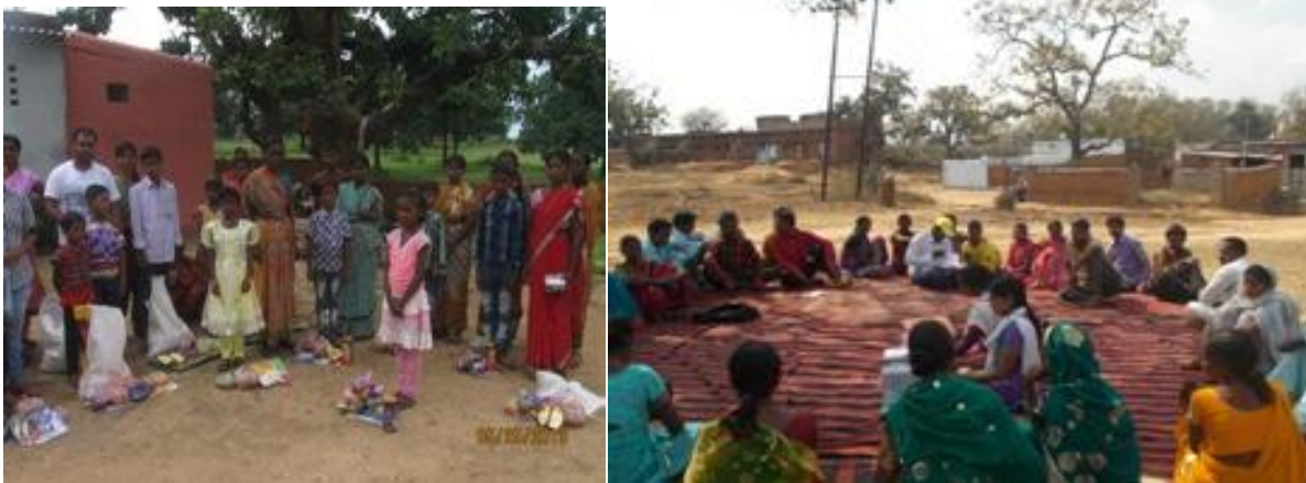
Children produced in front of CWC for approval and placement and Meeting with Care Giver

Under the program, child recreation, cultural camps, children's club, life skill issues, birthday celebration were organized for their overall development and better socialization within the community. Periodic follow up and counseling to the care givers on essential child care services focusing on child care and protection was provided. In addition, regular meeting, training and exposure had been organized for PRI members, AWW, Sahiya, SHG members on the issue of community based alternative child care. Besides, advocacy inventiveness were initiated on these issue to develop alternative child care models as per the context of Kuju coal mine area.