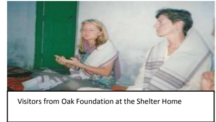
Visitors from Oak Foundation at the Shelter Home