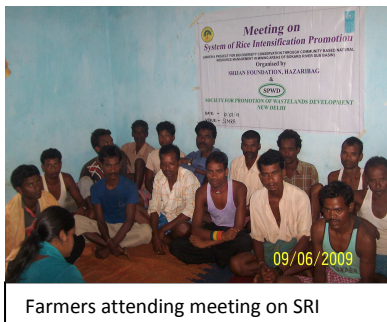
Farmers attending meeting on SRI

For the advancement of this SRI technology a series of Community Mobilization, Capacity Building & Hand holding & Input Support were extended to the farmers through identified 30 Progressive Farmers and Master Trainers. Officials from agriculture departments and local administrant paid visit to the site besides that they also helped farmers by distributing paddy seed and fertilizers in Ormanjhi, Ranchi & Mandu, Ramgarh. The program is being supported by SPWD, Ranchi.