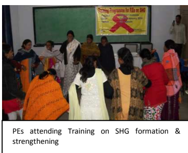
PEs attending Training on SHG formation & strengthening

Capacity building of Peer Educators (16 from the same FSWs) is one of the key pivotal activities for extending quality services through mobilization of FSW community. Besides this thrust is also given on creating an enabling environment and advocating issues of discrimination, valance and rights and entitlements. In this regard a process has been initiated to form SHGs in all the 12 key locations.