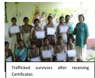
Trafficked survivors after receiving Certificates

Besides continuing regular activities of strengthening of Vigilance Committee, organizing 16 days events, meeting with District & Government officials on the issue of trafficking, a focus was onto dignified rehabilitation of 10 survivors of trafficking. The survivors were given 4 months of residential training on Trade (Tailoring) Specific Skill Development as well as Life Skill Development at Jan Sikshan Kendra, Bariyatu, Ranchi. On the closing ceremony certificate and tailoring machine was distributed among all the 10 trafficked survivors.