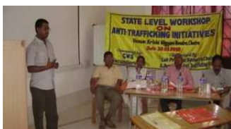
Government officials attending State Level Workshop on Trafficking

During the period 4 Core Groups meeting was organized at Ranchi office and 1 State Level Workshop was organized at Chatra. The program is being supported by CWS, Secunderabad and JRC – CWS, Jamshedpur.