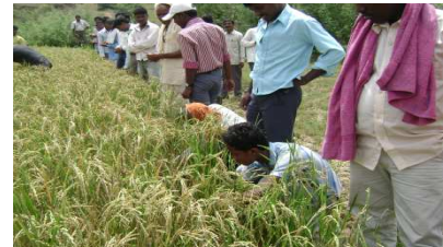
Farmers observing the Paddy produced using SRI techniques

As part of the Agriculture Development, SRI (System of Rice Intensification) technology was promoted with the objective of increasing Household Level Food Sufficiency through innovative production technology. A total of approx 500 farmers from 25 villages of Ormanjhi (Ranchi) & Mandu (Ramgarh) were directly covered under the program.